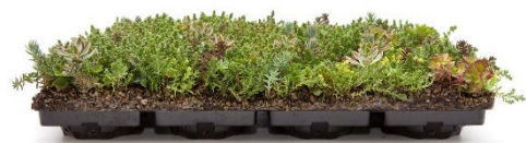
Fig 2. A view of Standard 60/25 module

Nature Impact Green Roof Standard consists of recycled plastic trays, substrate and plants – at least 12-15 species of sedum, approx. 4 of them are naturally occurring species in Danish vegetation. Coverage minimum 90%. Can be applied to roofs with a slope of 0 to 25 degrees (above 14 degrees support profiles should be installed).