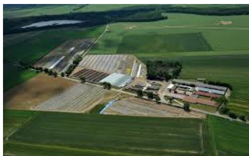
Fig 1. A view of Kompozycje Ozdobne the nursery for Nature Impact - Karwice Sp z o.o. in Karwice (Poland).

Nature Impact A/S is a Danish company that produces and delivers concept-based systems solution within green roofs and plant walls. Nature Impact was founded by the Larsen family in 2013. The family has been in the gardening and horticulture industry for 5 generations. Nature Impact A/S's nursery, Kompozycje Ozdobne - Karwice Sp z o.o., is located in northern Poland.